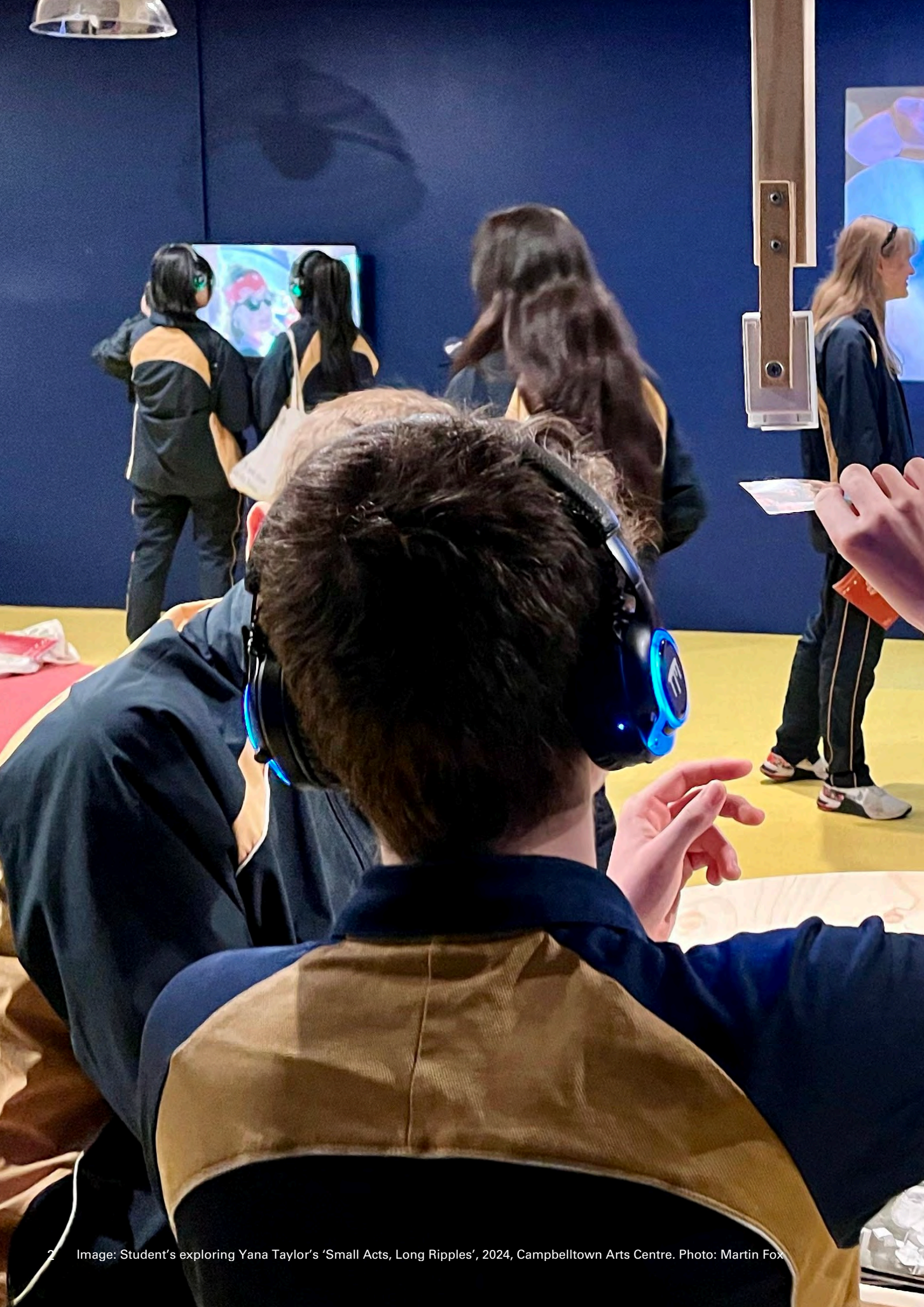
2 Image: Student's exploring Yana Taylor's 'Small Acts, Long Ripples', 2024, Campbelltown Arts Centre.