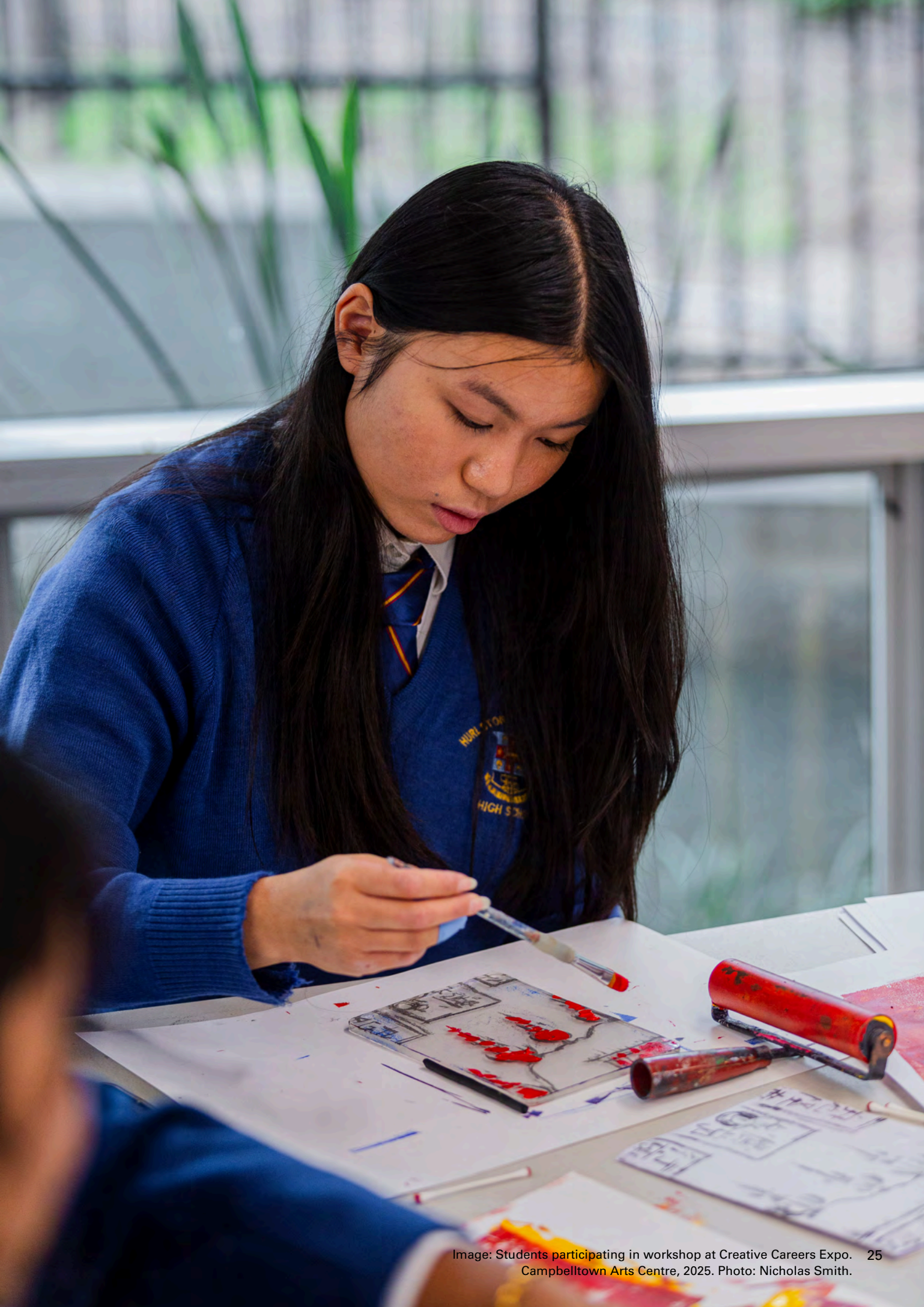
Image: Students participating in workshop at Creative Careers Expo. 25 Campbelltown Arts Centre, 2025.