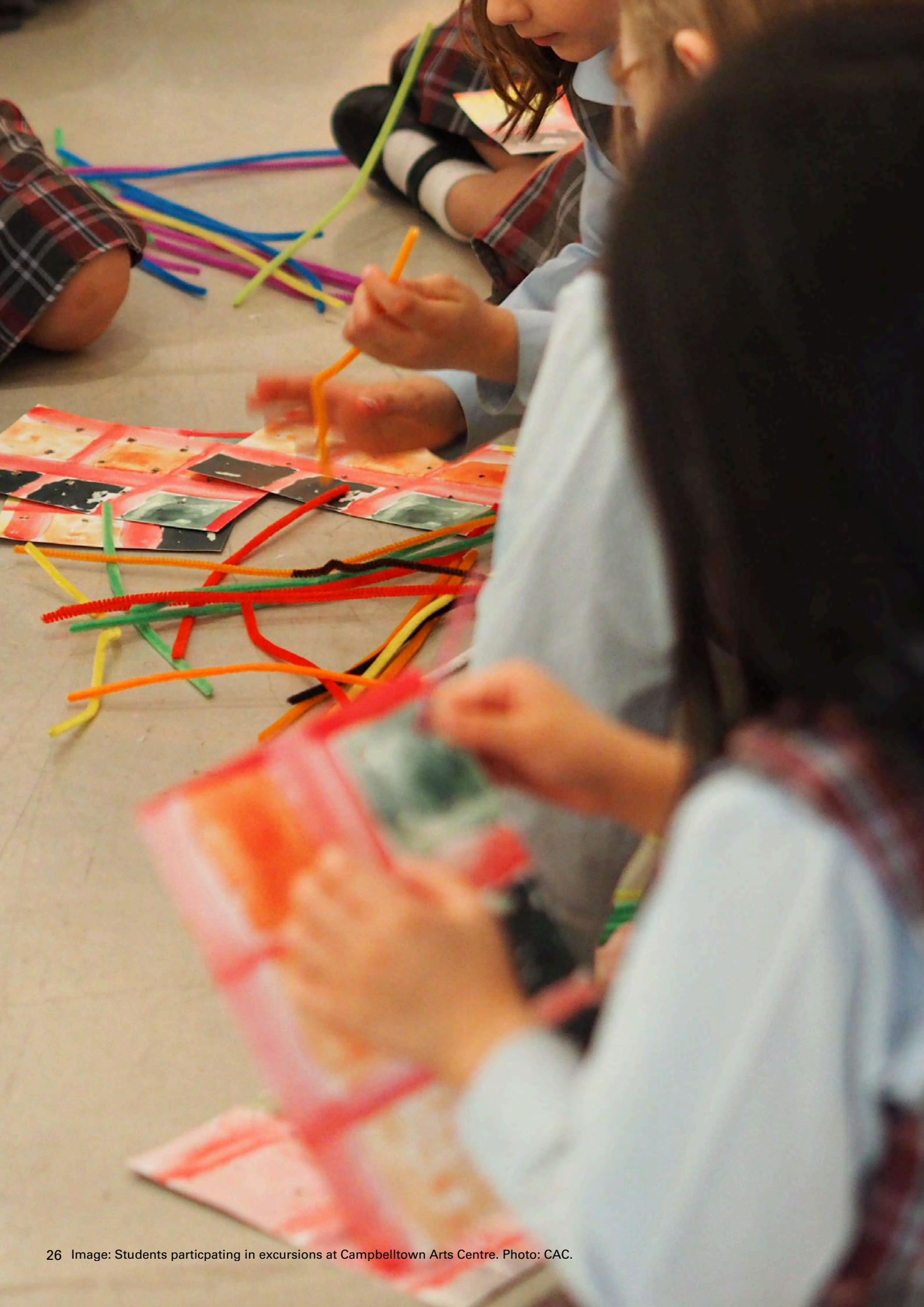
26 Image: Students participating in excursions at Campbelltown Arts Centre.