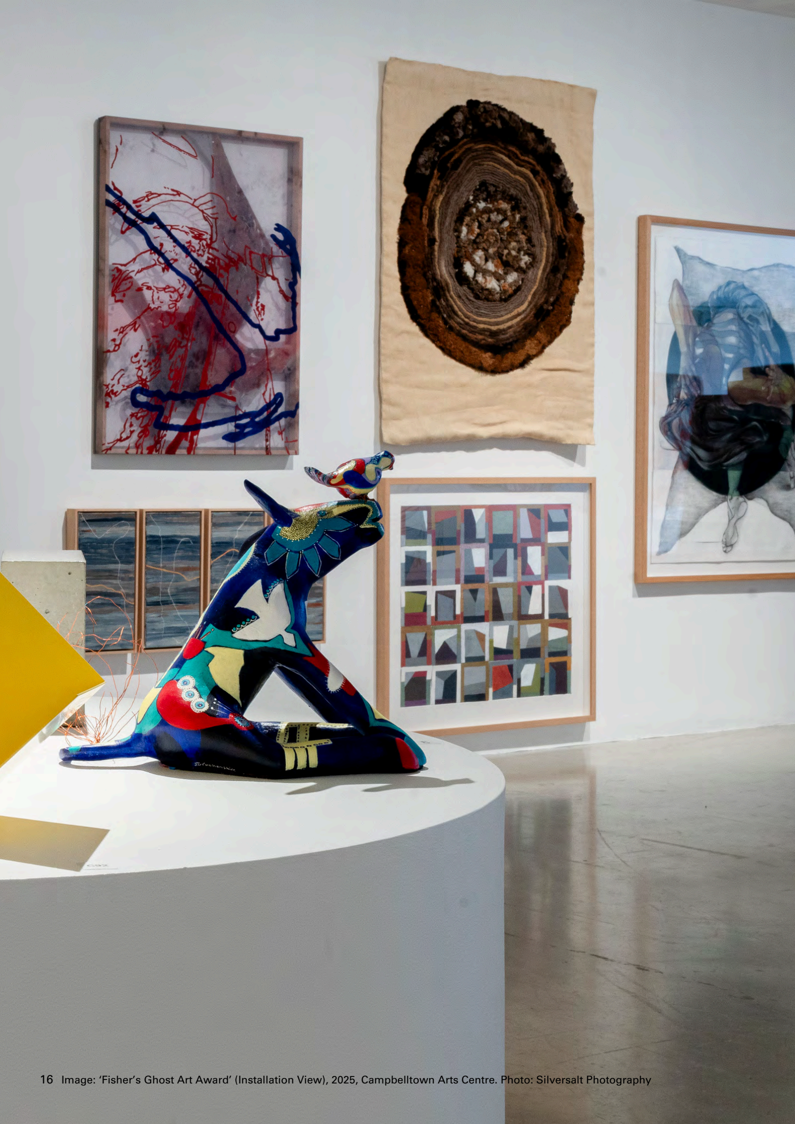
16 Image: 'Fisher's Ghost Art Award' (Installation View), 2025, Campbelltown Arts Centre.