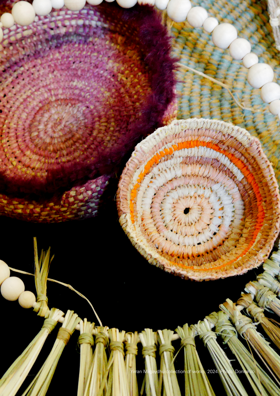
Yirran Miigaydhu collection of works, 2024.