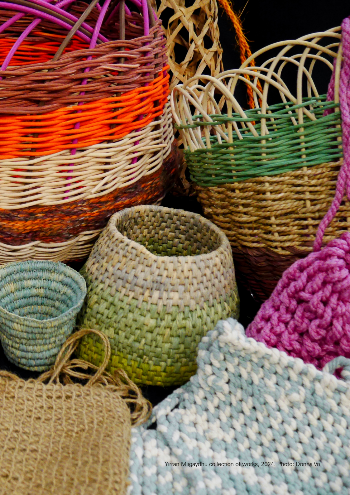
Yirran Miigaydhu collection of works, 2024.